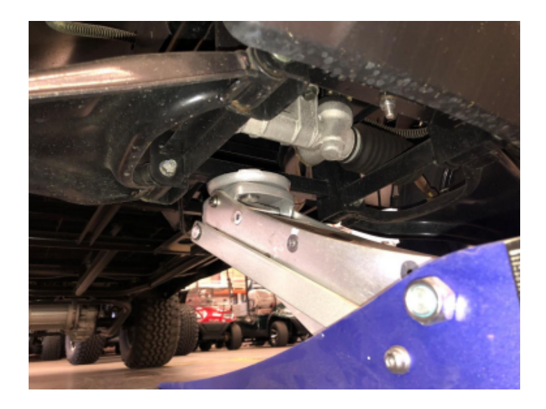
The center frame directly behind the steering rack.